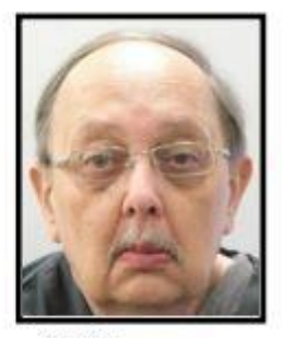
DATE OF PHOTO: